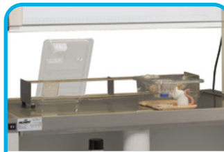
Cage Lid Holder