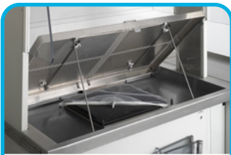
Removable Prop-Up Work Tray & Washable Mesh Pre-Filter