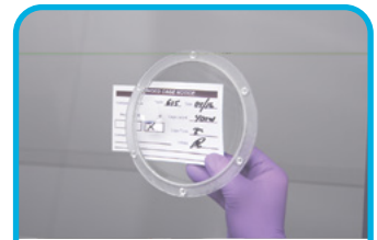
Window Sash Magnifying Glass