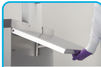
Stainless Steel Folding Shelf