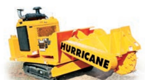
Hurricane RS Series Track-Mounted