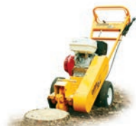
900H Series Walk-Behind

Check out the great lineup of other Carlton products.