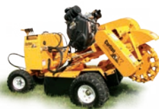
SP4012 Series Self-Propelled