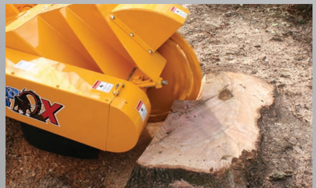
Razor Cutting System provides large smooth cuts while reducing chip spread with increased tool life.