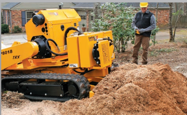
Hydraulic Scrape Blade and high torque ground drive system provides plenty of power to make clean up a snap