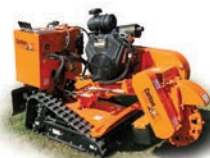
SP5014 TRX Series Track-Mounted