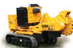
SP7015 TRX Series Track-Mounted